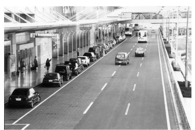
airport terminal / so

In this part, you can move to the next question by clicking on Next . If you want to return to a previous question, click on Back . You will have 8 minutes to complete this part of the test.